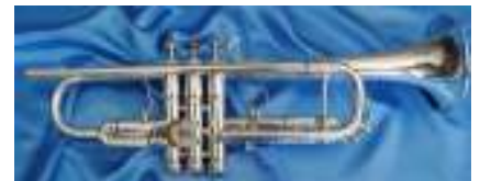
EMO World Deluxe