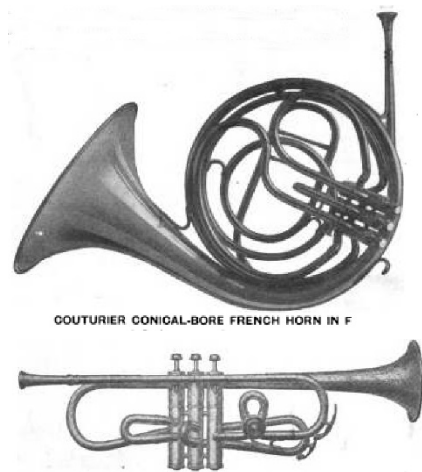
COUTURIER CONICAL-BORE FRENCH HORN IN F