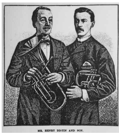
1902 Distin London model cornet #17465 (photo 1) Engraving to left is of Henry and William Distin in the April, 1889 publication The British Bandsman , page 157.