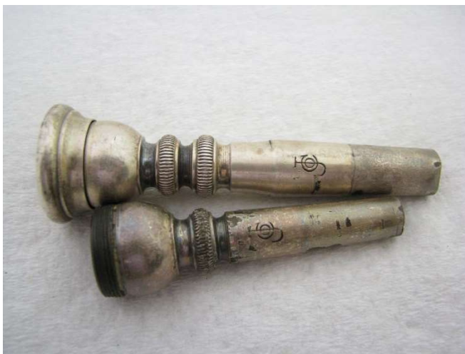
Arrigoni model c.1924