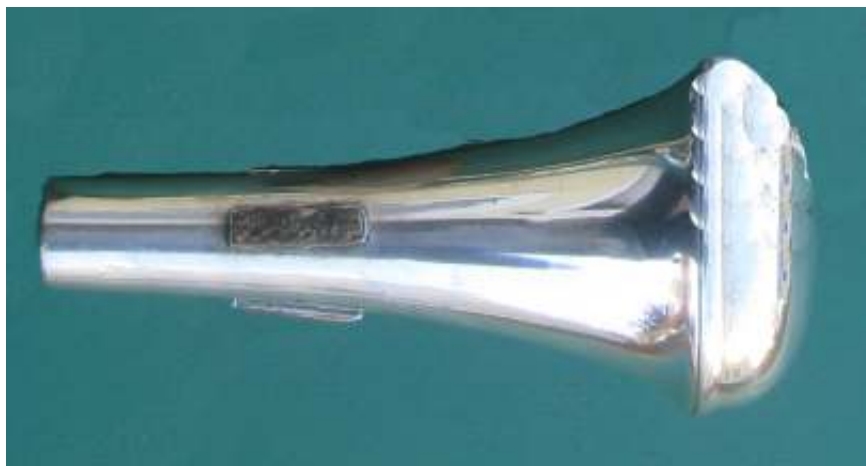
Another cornet mute from c.1920 (author's collection)