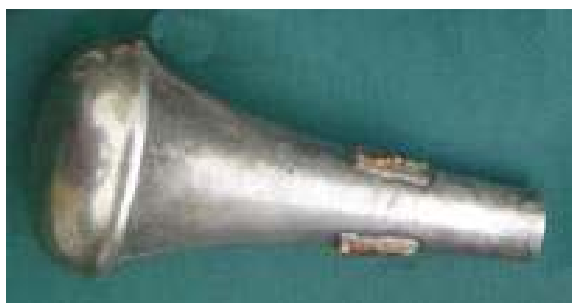
Trumpet mute with #25714; a rare fiber version (auction photo)