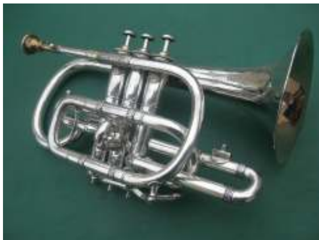
Cornet #9034 below is early Phila. example