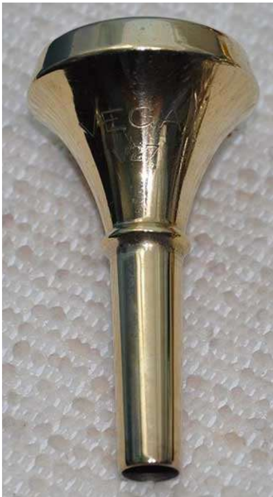
Trombone model V27 below from the same era (auction)