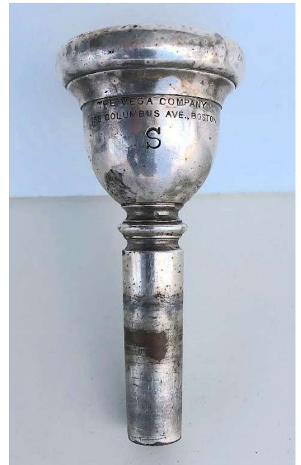
Older tuba model S