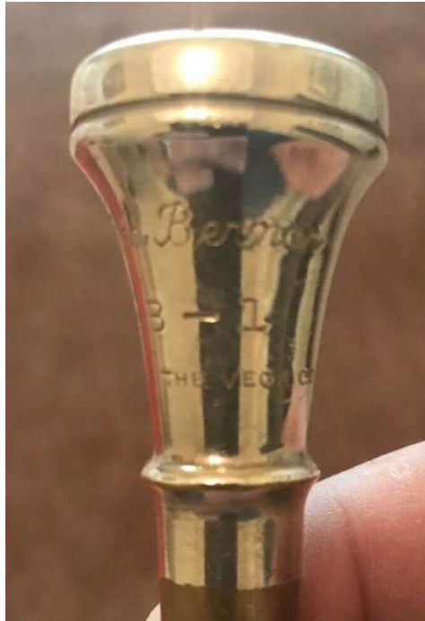
Berman model B-2 trumpet