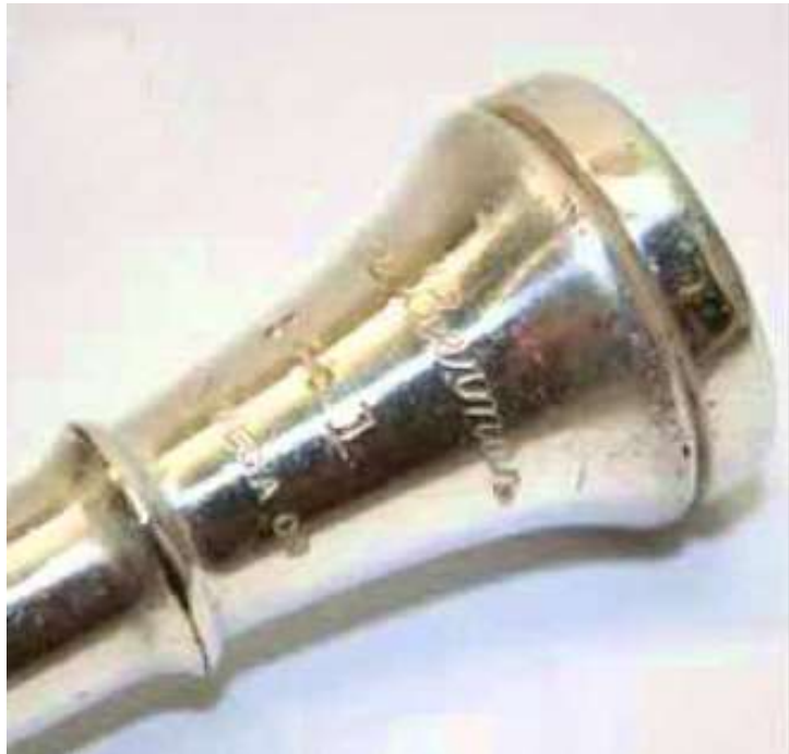
Vega C3 trumpet mouthpiece at right (author's collection)