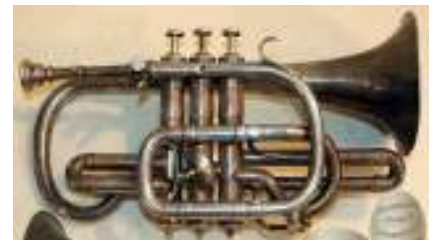
c1932 ad for New Radio trumpet, established over 80 years