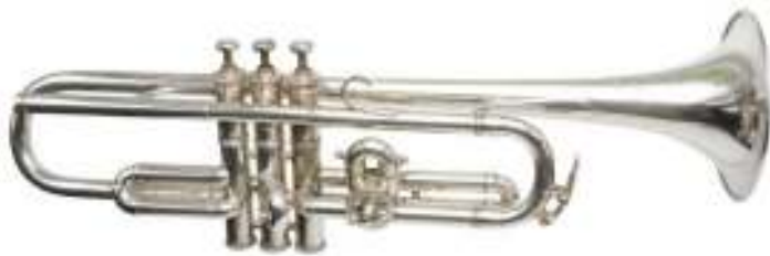
1929 presentation cornet #16987 is dated 1929 (below, Univ. of Edinburgh)