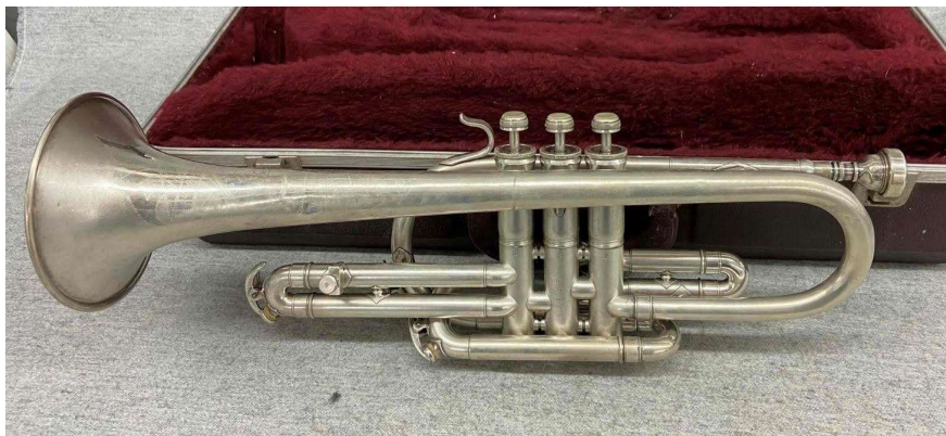
Cornet #20212, a copy of the King Master model c.1940.

The original factory would have extended to the upper portion of the aerial view at right. This appears to be a remnant.