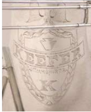
Style 6: oval with Keefer, sometimes highly engraved [by Charles Otto]