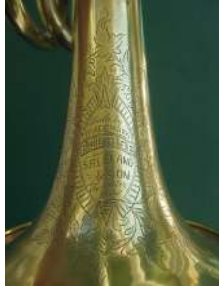
#978 (auction photos); the highest number found so far; similar to the Rex model but the only fixed lead pipe model found; the serial number has moved to the bell engraving