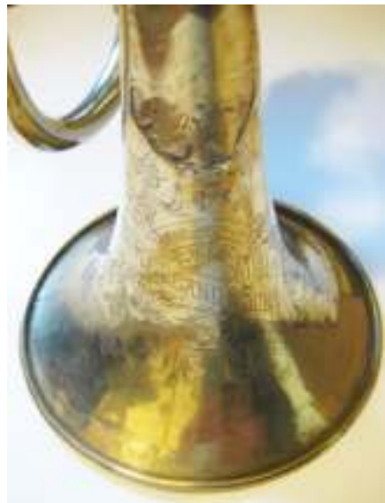
#901 (author's photos)