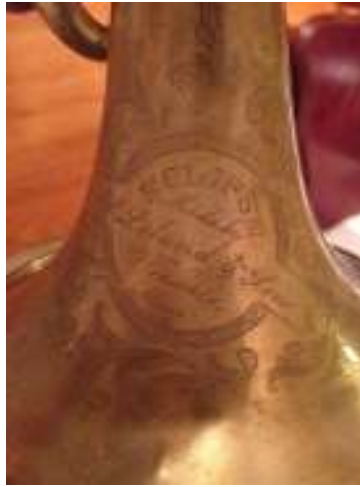
#363 (auction photos)