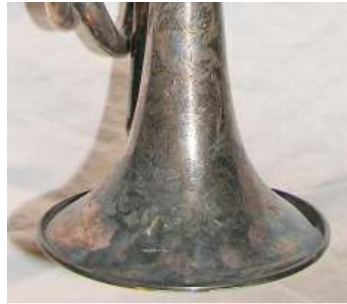
#459 (auction photos)