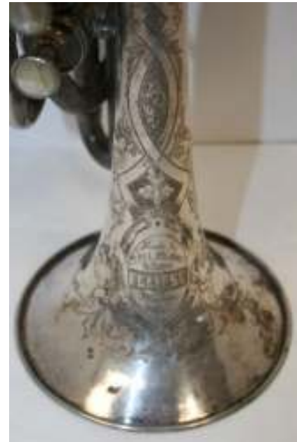
#694 (auction photo) matching the Clement model direct air passage ad from 1904