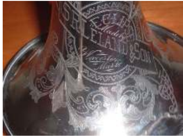
#625 (auction photos); I had the same leather case with another Eclipse cornet but it was too far gone to save; this is an example of the "New 1897" design