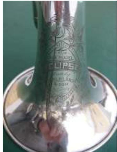
#807; only Simplex model found