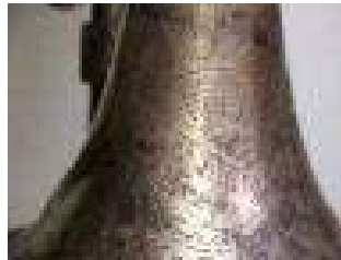
#520 (auction photos), only one found with Bb/A valve