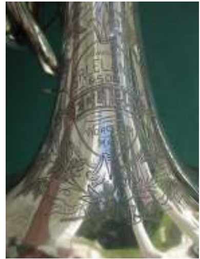
#760 (author's photos); the only Rex model I have seen