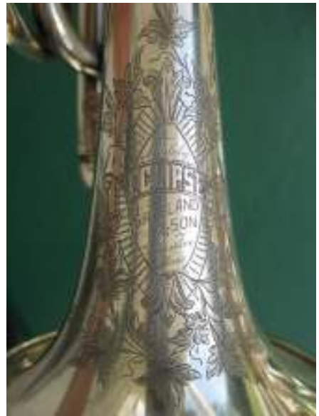
#860 (author's photos); the only Eb found; I am showing this in numerical order but the style would suggest this was made at the same time as Bb models in the 500-600 range c.1896