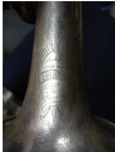
#931; complete with case, high & low pitch slides & mute