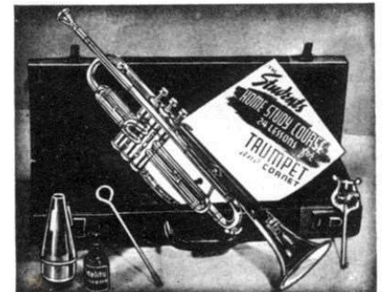
1941 Barth-Feinberg catalog Musketeer trumpet