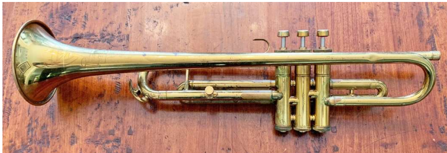
Musketeer with unknown serial # (auction photo)