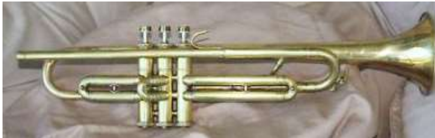
“Made in Elkhart” #53509 c.1940 (auction photo).