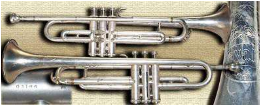
Musketeer Maestro #52xxx c.1940 (auction photo)