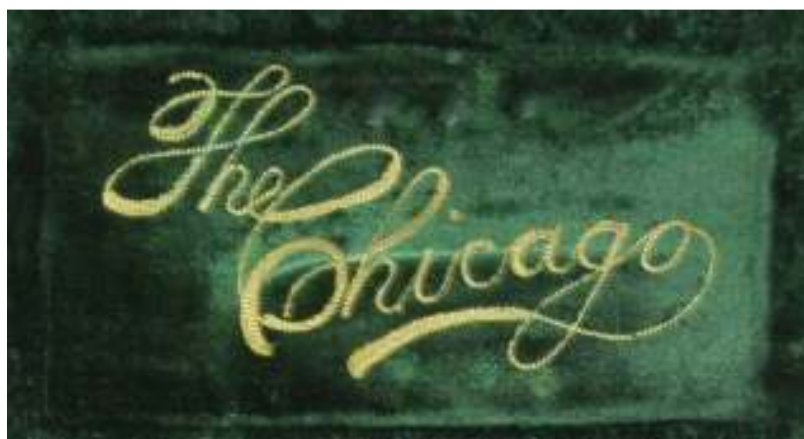
Photo 3, page 1, is T&H cornet #246 (Horn-u-copia.net); photos 6 & 7, page 1 and photo 1 this page are #701 (Horntrader.com); photos 2-4 this page are cornet #1401 labeled "The Chicago" (auction photos)