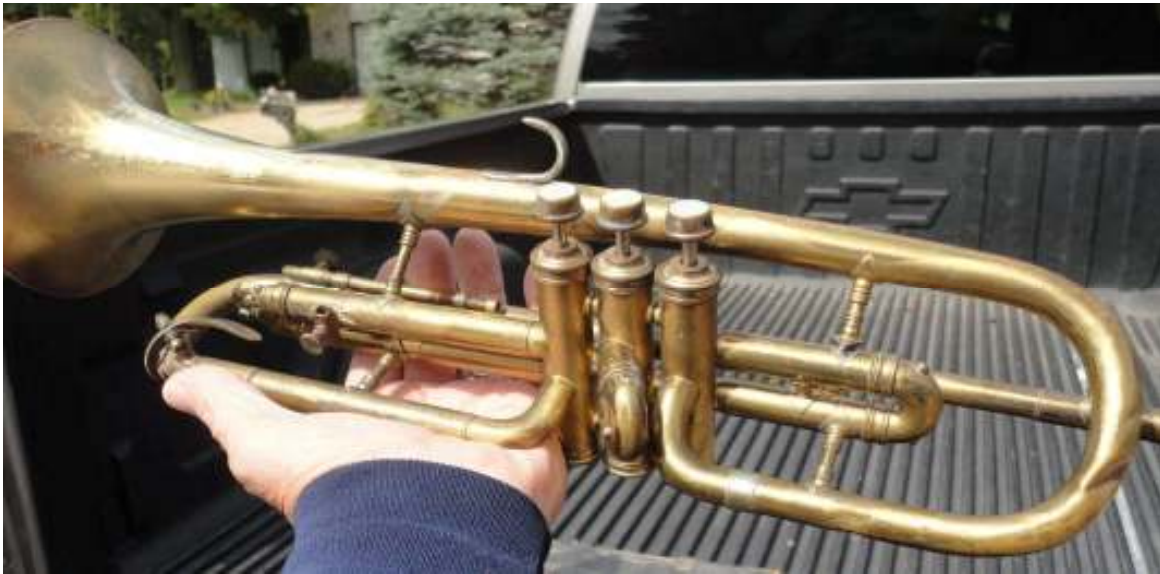
Here is cornet #120725

I believe this is the same one later restored. The bell braces were loose and the owner tried playing it without the front brace only to find he liked the sound better so left it off.