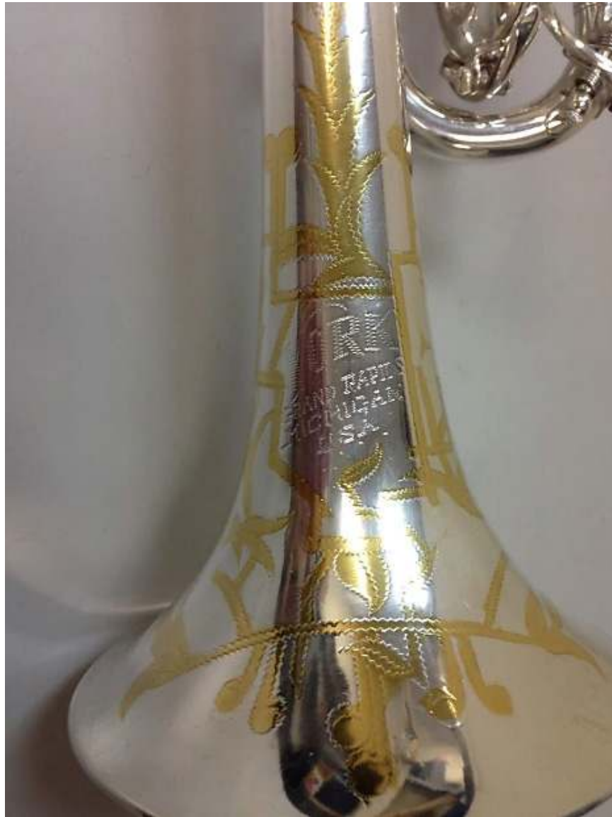
Trumpet serial #?