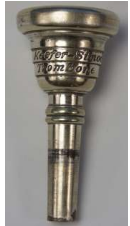
1920s Keffer-Simons mouthpiece